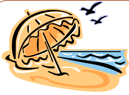
Myrtle Beach has beaches and many golf courses!