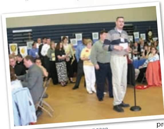
Education Summit open forum April 2008

The Catholic Schools Office and the Diocese of Joliet have retained the services of Meitler Consultants to develop a strategic plan to strengthen and revitalize Catholic schools in the diocese and to ensure their viability and effectiveness in the future.